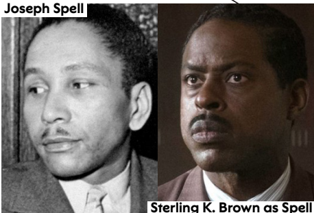
Sterling K. Brown as Spell