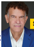
Hosted by: brian stokes mitchell